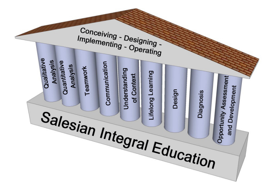
Figure 1. Graduates' Profile of UNISAL Engineering Programs

UNISAL represented the desired profile of the graduating student as illustrated in Figure 1. At the base is a "whole" education; this is the structural feature of the desired profile of the student upon completing a UNISAL program and it is guided by the institutional mission. We understand "whole" to mean consistent theoretical education, the development and skills and competencies, unity of theory and practice, the development of strong and Christian ethics, and social and political commitment. The purpose of this is to educate professionals and qualified experts to join professional sectors and to participate in the development and transformation of Brazilian society as autonomous individuals. In Table 1 we present the competencies which comprise whole education, the purpose of which is creating engineering graduates qualified in the "conceiving, designing, implementation and operation" of complex systems and products, especially in collaborative environments.