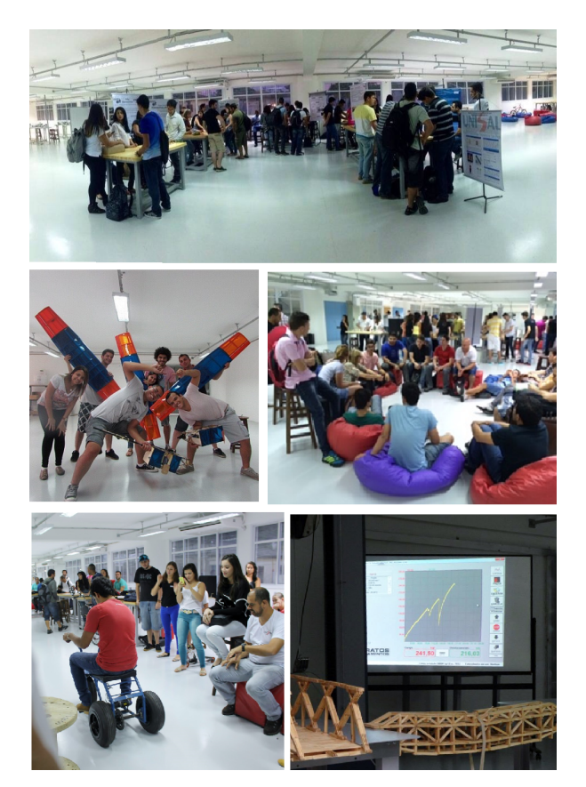
Figure 8. Engineering Workspaces Standard CDIO #6

When laboratories were built for the programs, large and multidisciplinary spaces were favored. Except for certain specialized environments like, for example basic chemistry and the building processes of Civil Engineering, all of the laboratories were located in the same area without dividers. The size of the lab environments is about 550 square meters and pieces of equipment like oscilloscopes of the electrical and electronics lab coexist with lathes and mills of the manufacturing processes lab. In practice a layout was sought where from basic electricity, to analog and then digital electronics, through the metal forming and material testing laboratories a natural gradient was created between lighter and heavier equipment. Different classes pursuing different types of projects worked simultaneously in the lab. What should have been nuisances such as noise or the greater number of students actually provided an interesting opportunity to blend distinct but complementary content. The students were absolutely at ease and there were identifiable academic performance gains.