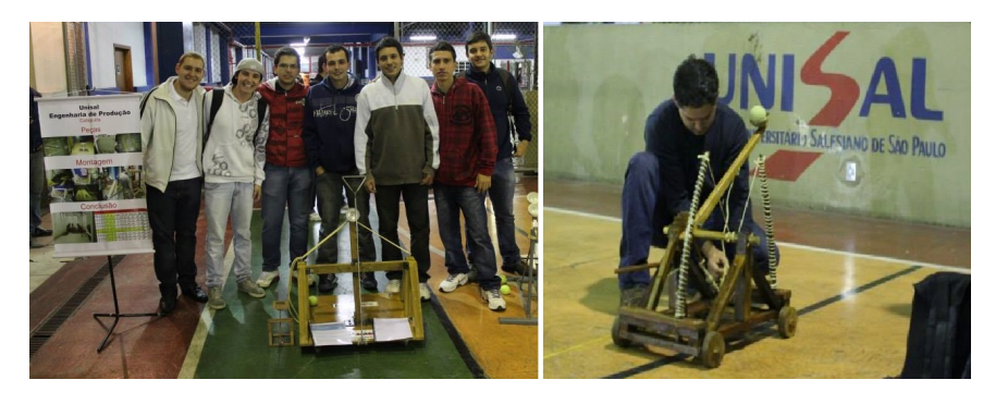
Figure 4. Flagrant launch catapults