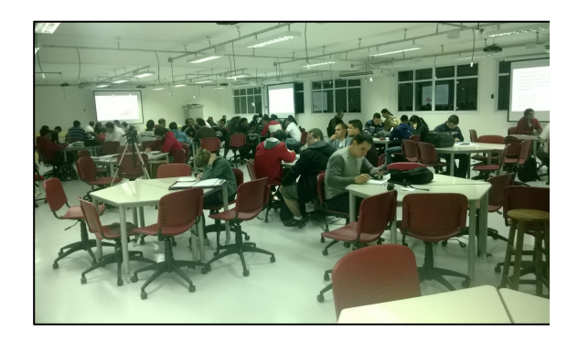
Figure 5. Er Figure 6. Eric Mazur Lab (indoor) (March/14)