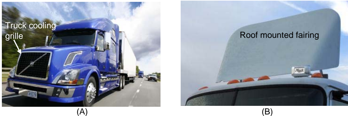
Figure 1. Volvo project photos: (A) Truck cooling grille, and (B) Roof mounted truck fairing.

A roof mounted fairing, Figure 1(B), directs the air flow around the nose of a trailer improving the aerodynamics and improving fuel efficiency. In some operations, trucks make trips without a trailer and the raised fairing creates unnecessary aerodynamic drag. The student team was asked to 1) design an automated lifting mechanism to raise and lower the roof mounted fairing and 2) to aerodynamically optimize the device shape and configuration to provide optimum performance in both the raised and lowered position. The team was tasked to construct a prototype to demonstrate the mechanical operation and to provide a computational fluid dynamics analysis of the aerodynamic performance.